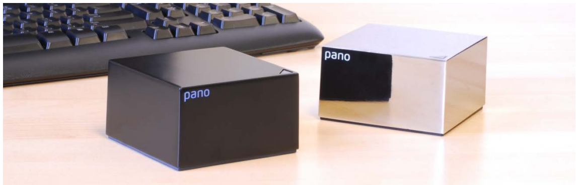
Zero Client Pano Device

The Pano Device is not just hardware. It comes as part of the complete Pano System, including the Pano Manager connection broker and virtual desktop management appliance, the Pano Direct Service client connection service and comprehensive technical support. Nothing else is needed to start deploying virtual desktops on top of your existing VMware vSphere 4 or VI3 infrastructure